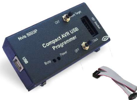
Compact AVR USB Programmer