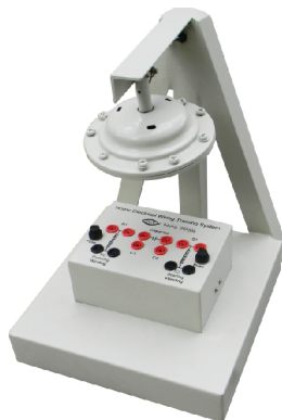
Ceiling Fan Unit